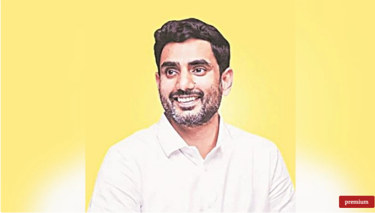
Nara Lokesh, IT Minister Andhra Pradesh. | File Image

Google's $15-billion AI hub in Vizag will anchor India's next big tech ecosystem as the state pivots from special status to investment-led growth, says Nara Lokesh