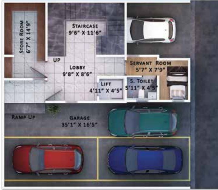
▲ BASEMENT FLOOR PLAN