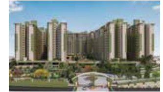
ANUGRAHA Vijayanagar Extension Bengaluru