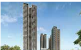
LAKERIDGE Kokapet, Hyderabad