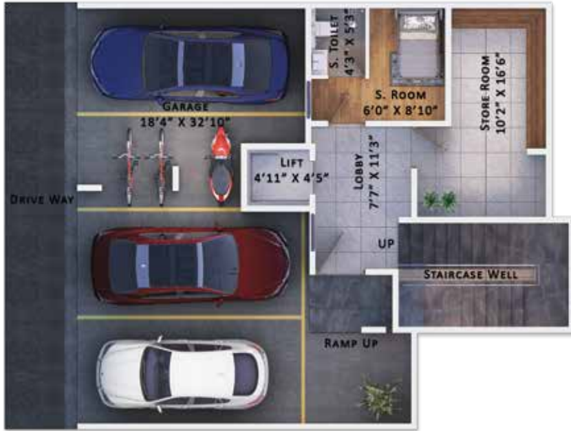
▲ BASEMENT FLOOR PLAN