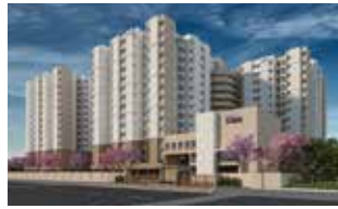
ASHRAYA Bengaluru-Mysuru Expressway Bidadi