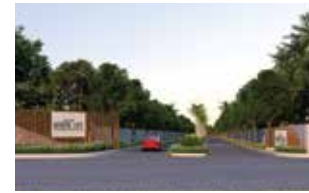
SERENE LIFE Shettigere, Bengaluru