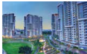
GREENAGE Hosur Main Road, Bengaluru