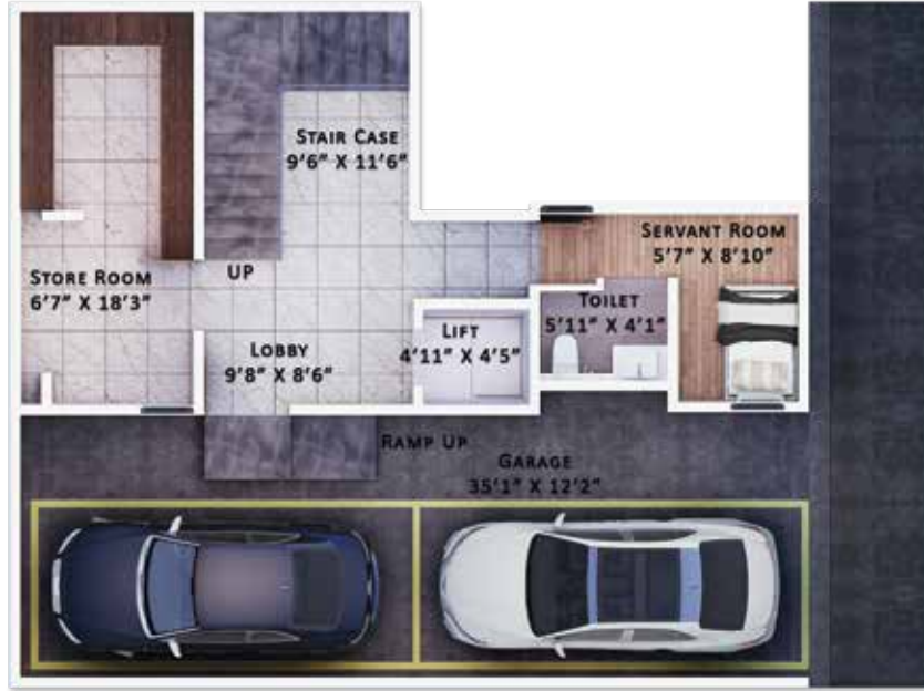
▲ BASEMENT FLOOR PLAN