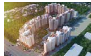
HM ROYAL Kondhwa (Opp. Talab factory) Pune