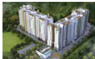
NAVARATNA RESIDENCY Avinashi Road, Coimbatore