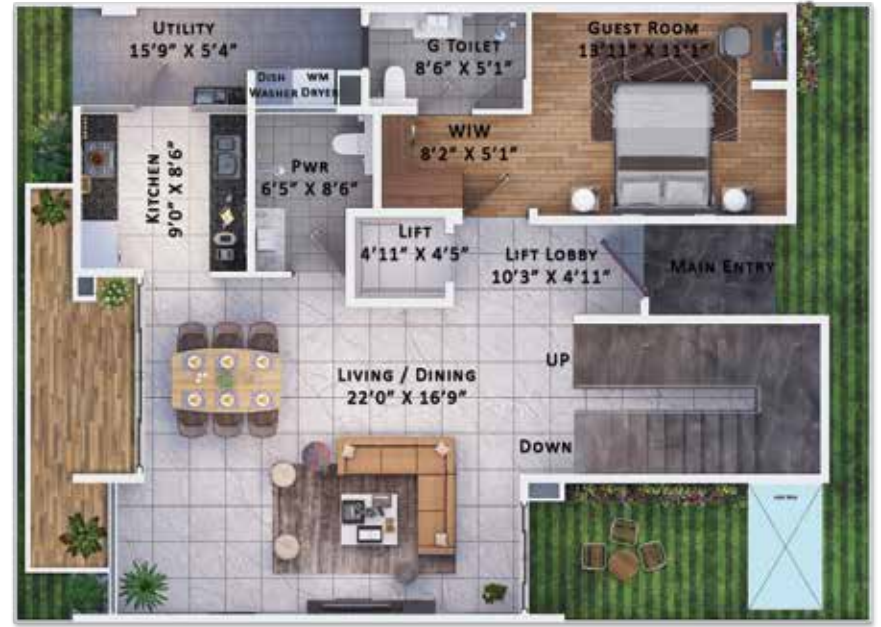
GROUND FLOOR PLAN ▲