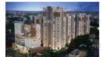
MAGNUS Shaikpet, Hyderabad