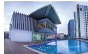
MAGNIFICIA Old Madras Road, Bengaluru