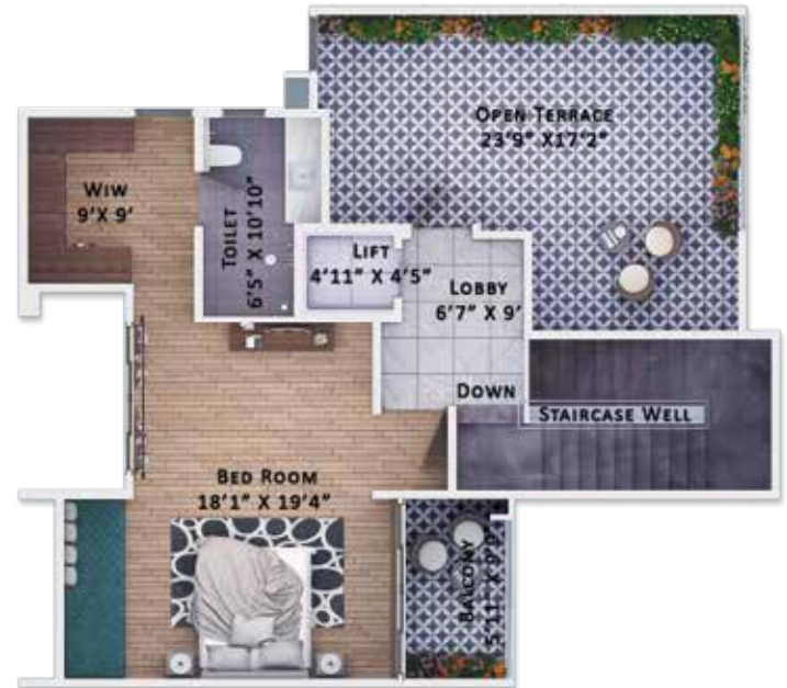
SECOND FLOOR PLAN ▲