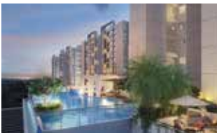
MISTY CHARM Off Kanakapura Main Road Bengaluru