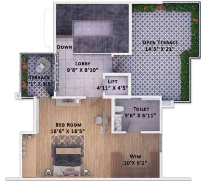
SECOND FLOOR PLAN ▲