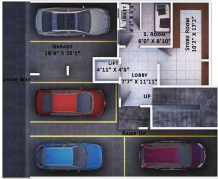
▲ BASEMENT FLOOR PLAN