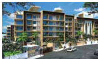
WATER'S EDGE Sancoale, Goa