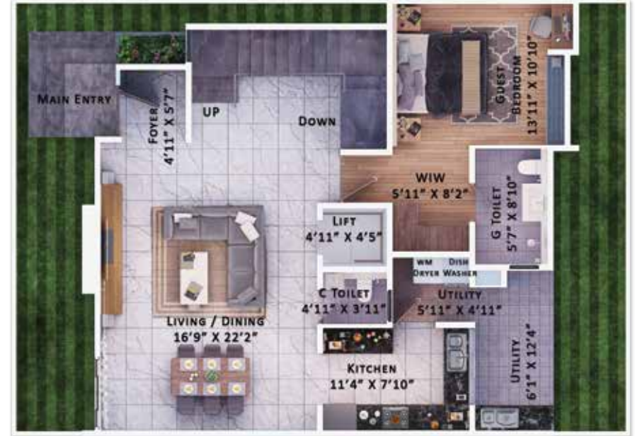
GROUND FLOOR PLAN ▲