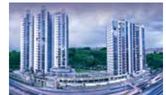
LUXURIA Malleshwaram, Bengaluru