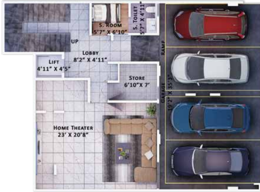
▲ BASEMENT FLOOR PLAN