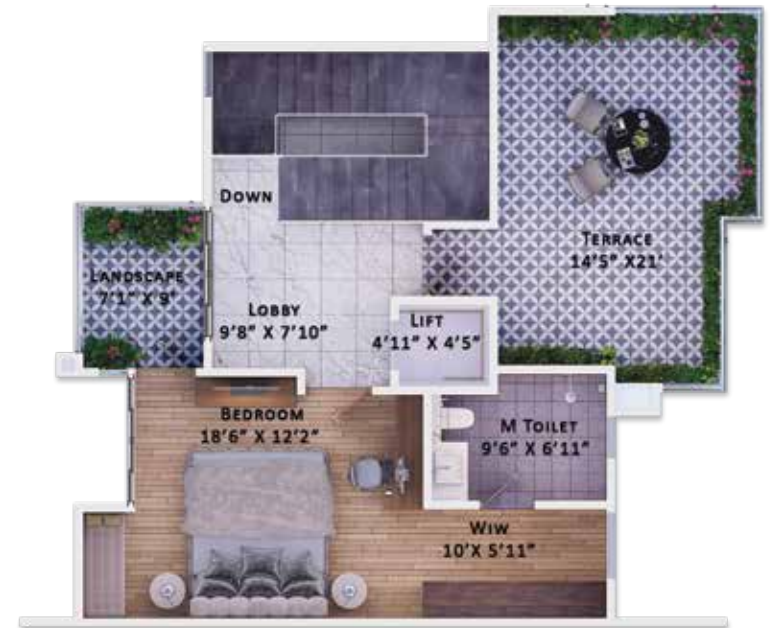
SECOND FLOOR PLAN ▲