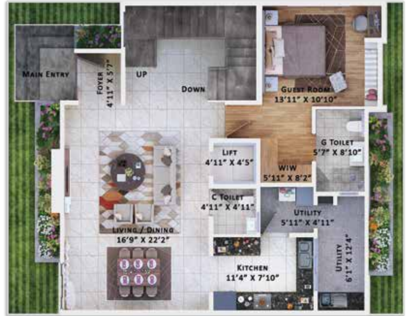
GROUND FLOOR PLAN ▲