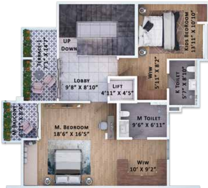
▲ FIRST FLOOR PLAN