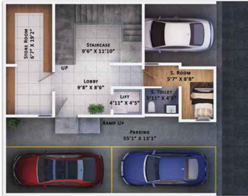
▲ BASEMENT FLOOR PLAN