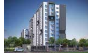
BLISS Off Budigere Road, Bengaluru