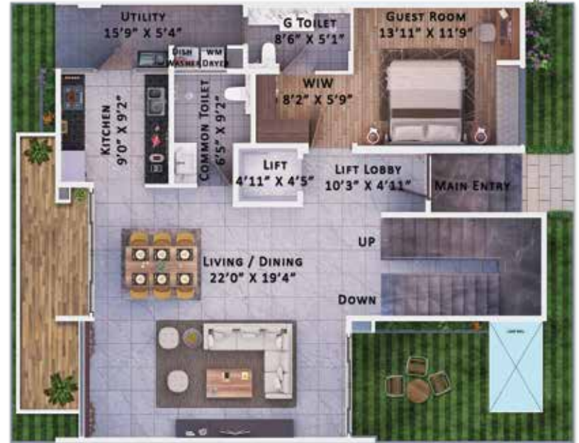
GROUND FLOOR PLAN ▲