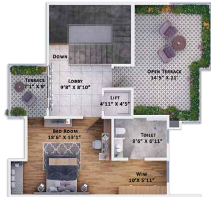
SECOND FLOOR PLAN ▲