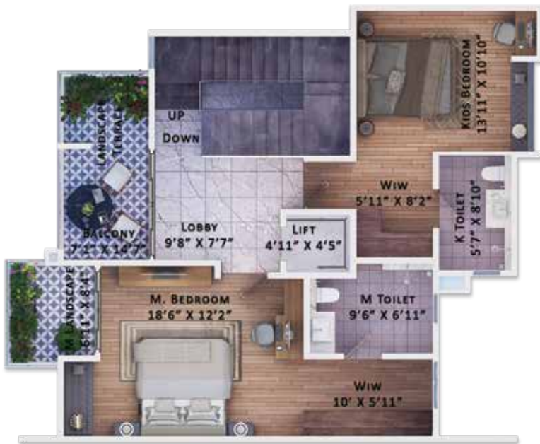
▲ FIRST FLOOR PLAN