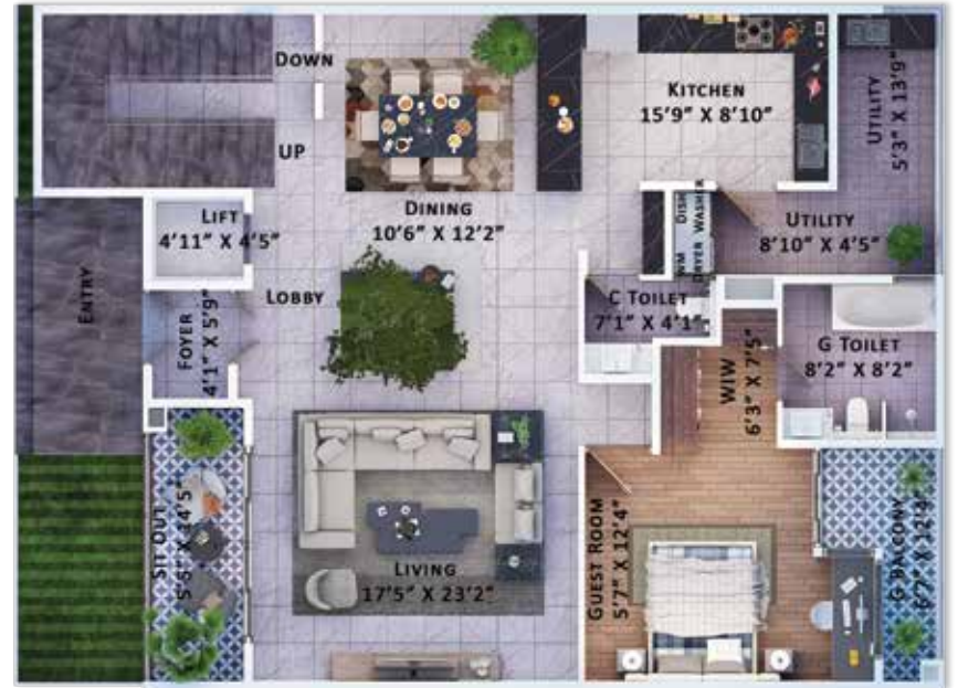
GROUND FLOOR PLAN ▲