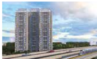
OPUS Tumkur Road, Bengaluru