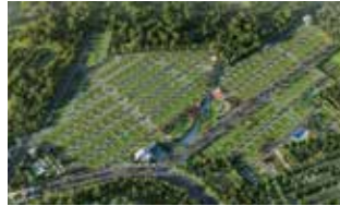
GREEN GROVES Nelamangala, Bengaluru