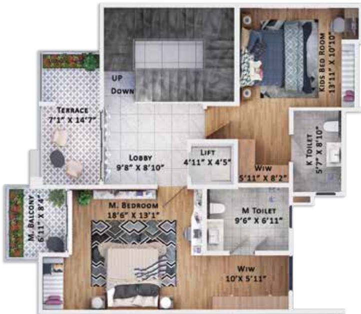
▲ FIRST FLOOR PLAN