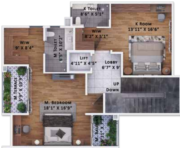
▲ FIRST FLOOR PLAN