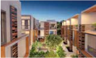
LA VITA Hennur Road, Bengaluru