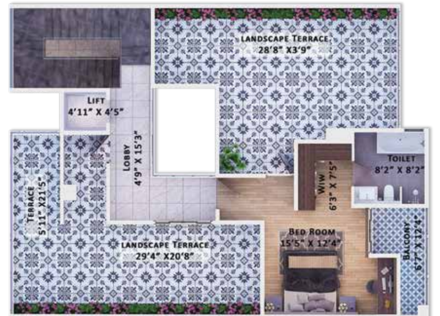
SECOND FLOOR PLAN ▲