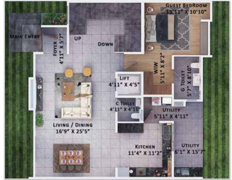
GROUND FLOOR PLAN ▲