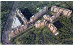
PARK CUBIX Devanahalli Town, Bengaluru