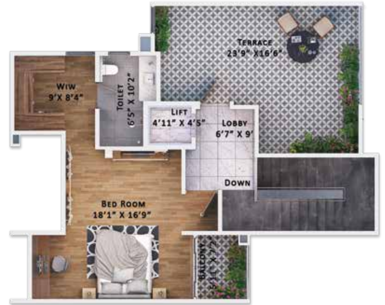
SECOND FLOOR PLAN ▲