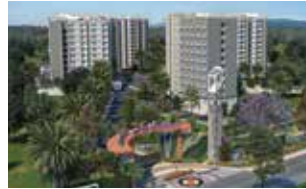
AEROPOLIS NH 44, Bengaluru