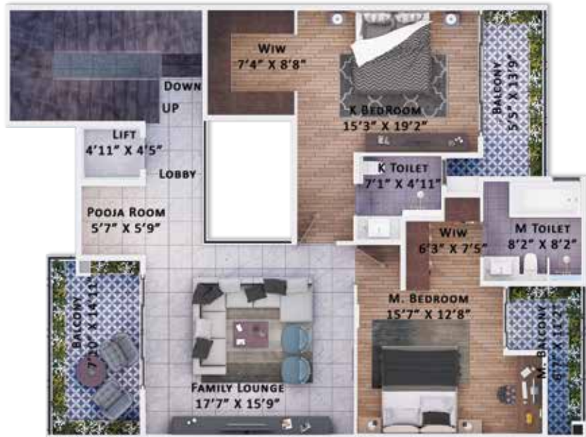
▲ FIRST FLOOR PLAN