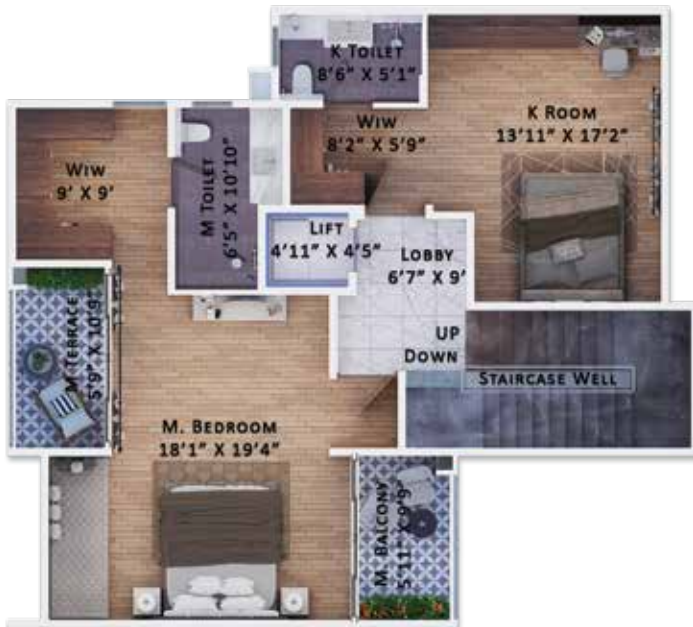
▲ FIRST FLOOR PLAN