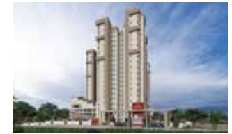
AQUA VISTA Bannerghatta Main Road Bengaluru