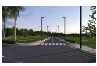
SERENE LIFE Shettigere, Bengaluru