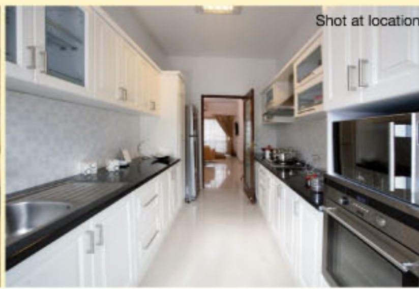
Shot at location