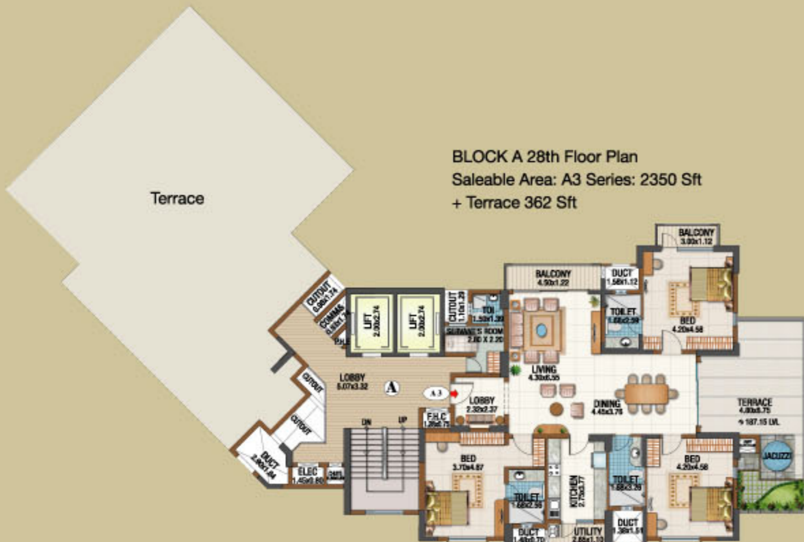
BLOCK A 28th Floor Plan Saleable Area: A3 Series: 2350 Sft + Terrace 362 Sft