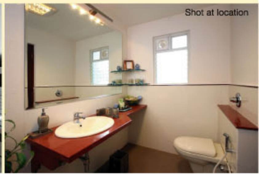
Shot at location