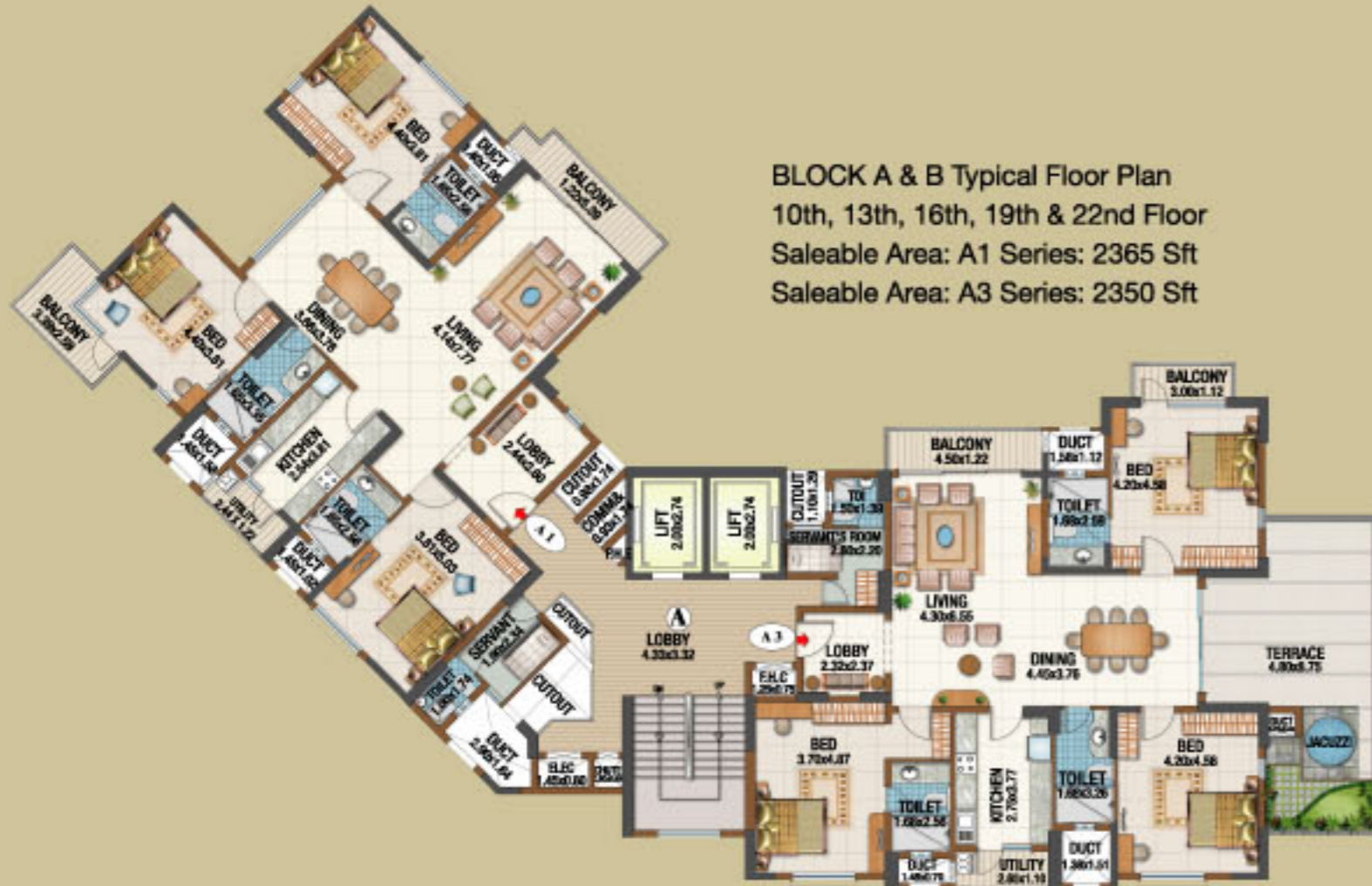
BLOCK A & B Typical Floor Plan 10th, 13th, 16th, 19th & 22nd Floor Saleable Area: A1 Series: 2365 Sft Saleable Area: A3 Series: 2350 Sft