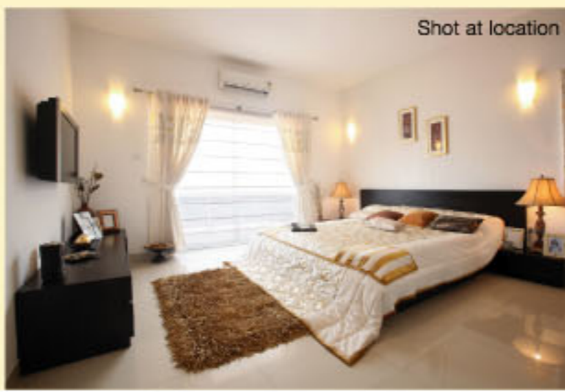
Shot at location