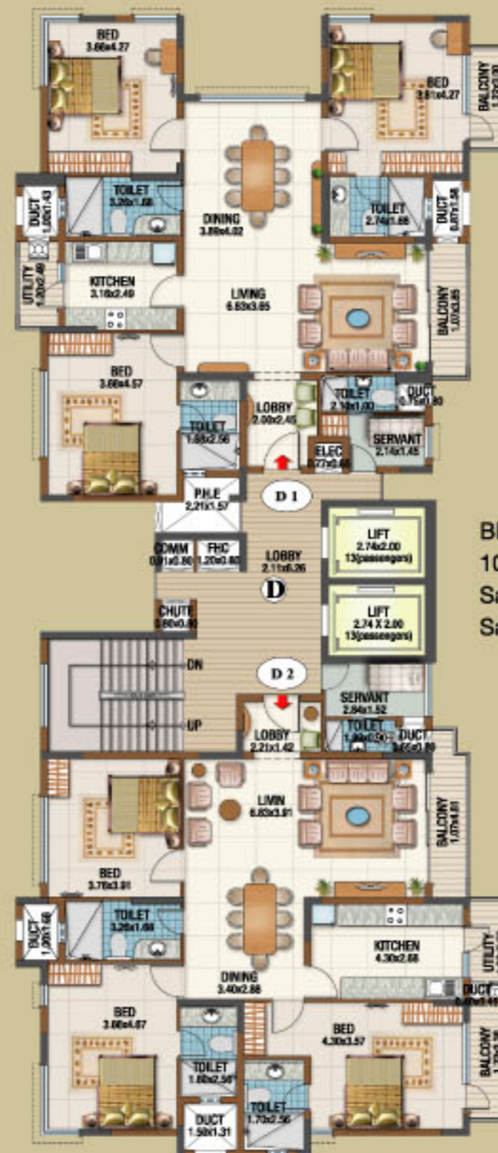
BLOCK C & D Typical Floor Plan 10th, 11th, 12th, 13th, 14th, 15th & 16th Floor Saleable Area: D1 Series: 2033 Sft Saleable Area: D2 Series: 2031 Sft