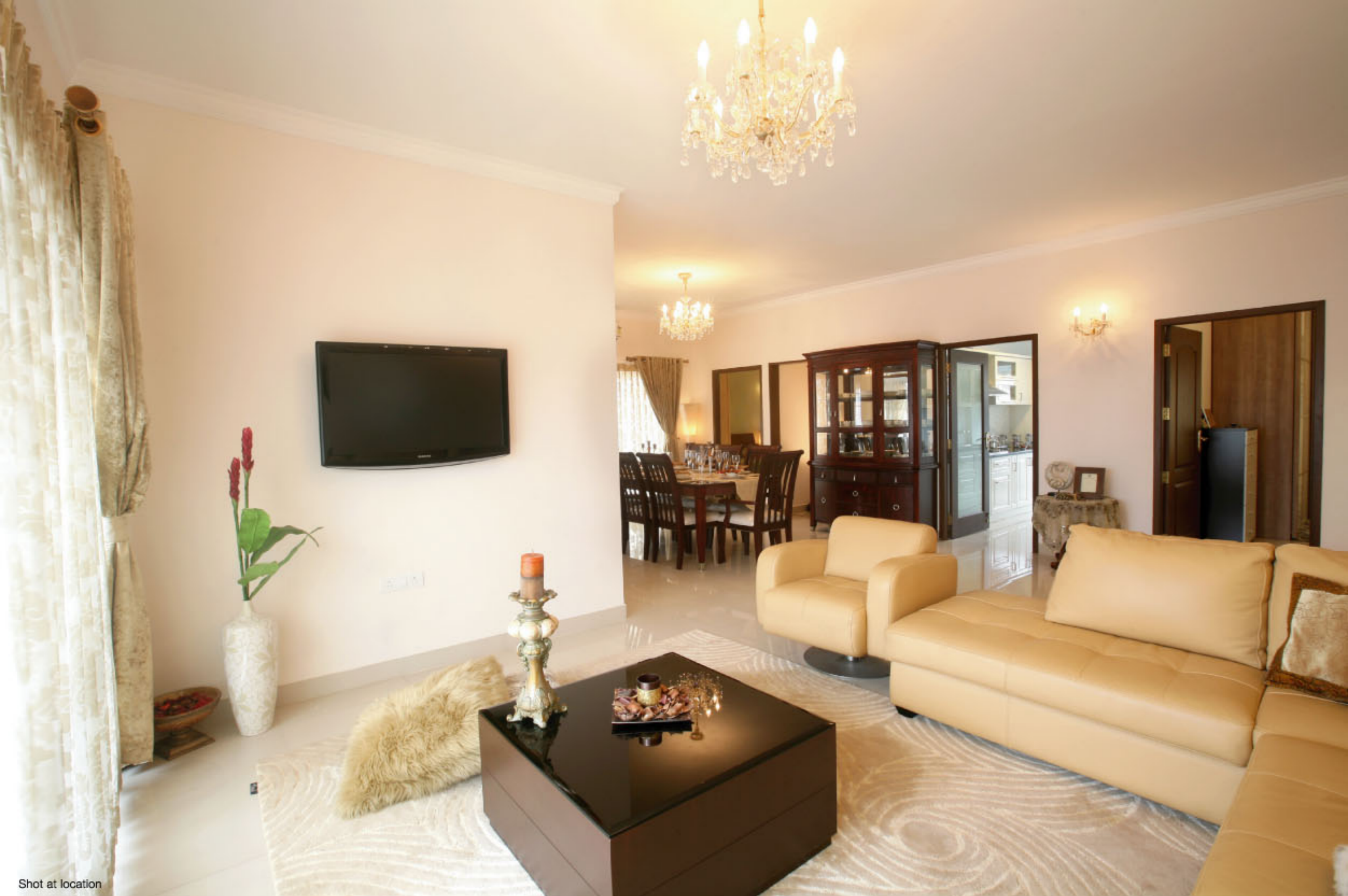
Shot at location