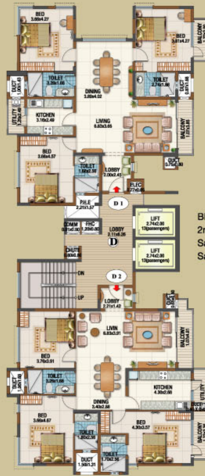
BLOCK C & D Typical Floor Plan 2nd, 3rd 4th, 5th, 6th, 7th, 8th & 9th Floor Saleable Area: D1 Series: 1942 Sft Saleable Area: D2 Series: 1933 Sft