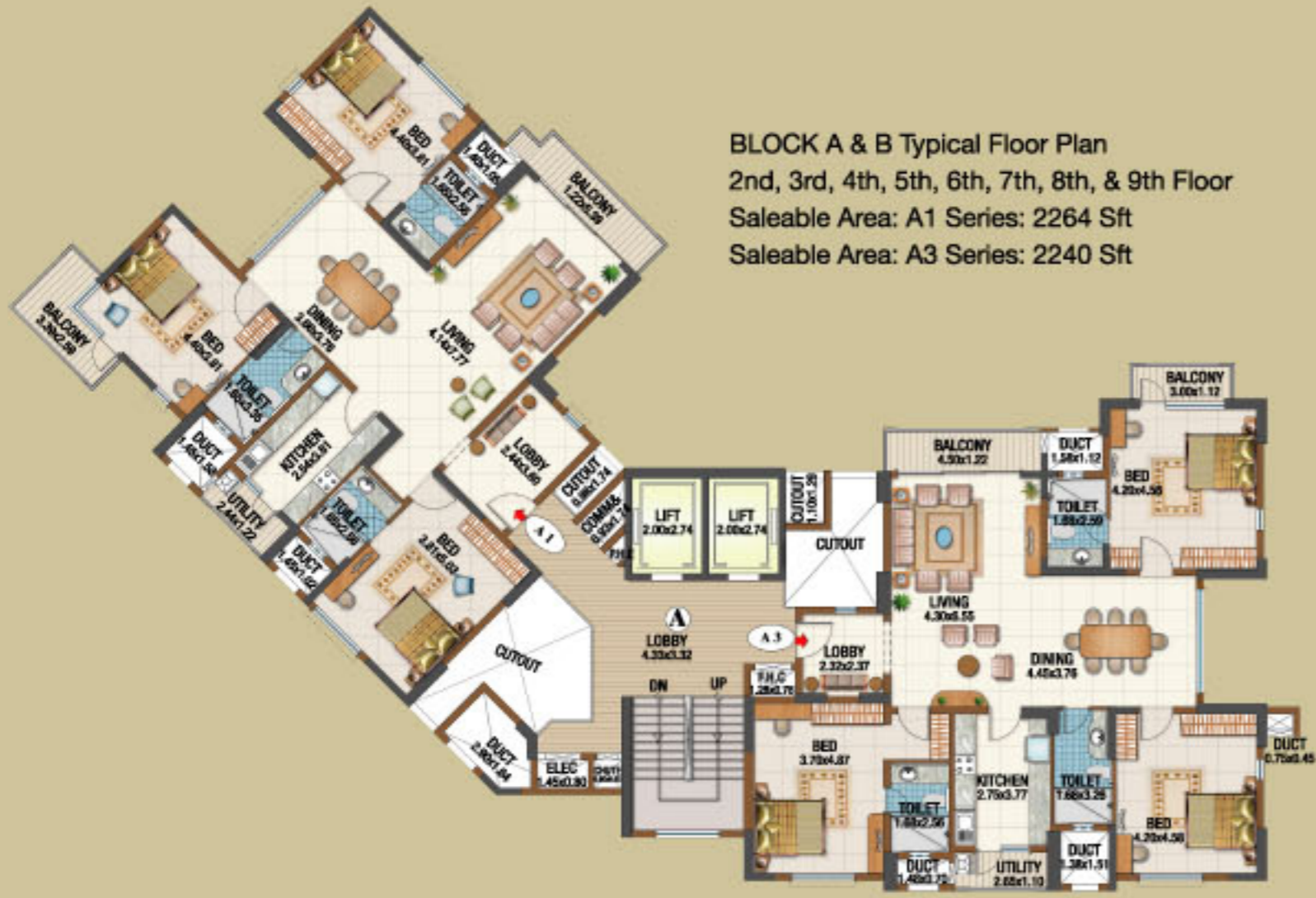
BLOCK A & B Typical Floor Plan 2nd, 3rd, 4th, 5th, 6th, 7th, 8th, & 9th Floor Saleable Area: A1 Series: 2264 Sft Saleable Area: A3 Series: 2240 Sft