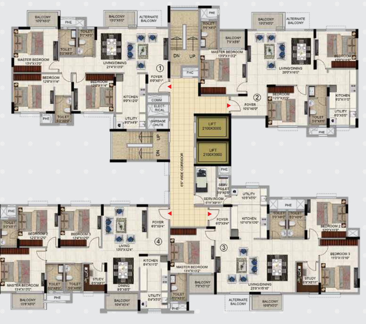
3 BHK + STUDY 1916 SFT