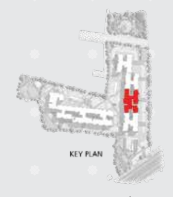
2 BHK + 2 T 1210 SFT