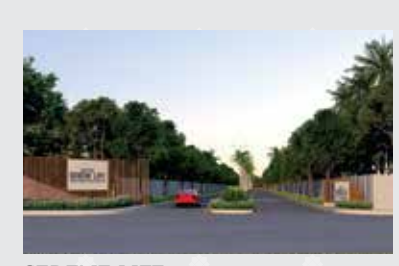
SERENE LIFE Shettigere, Bengaluru