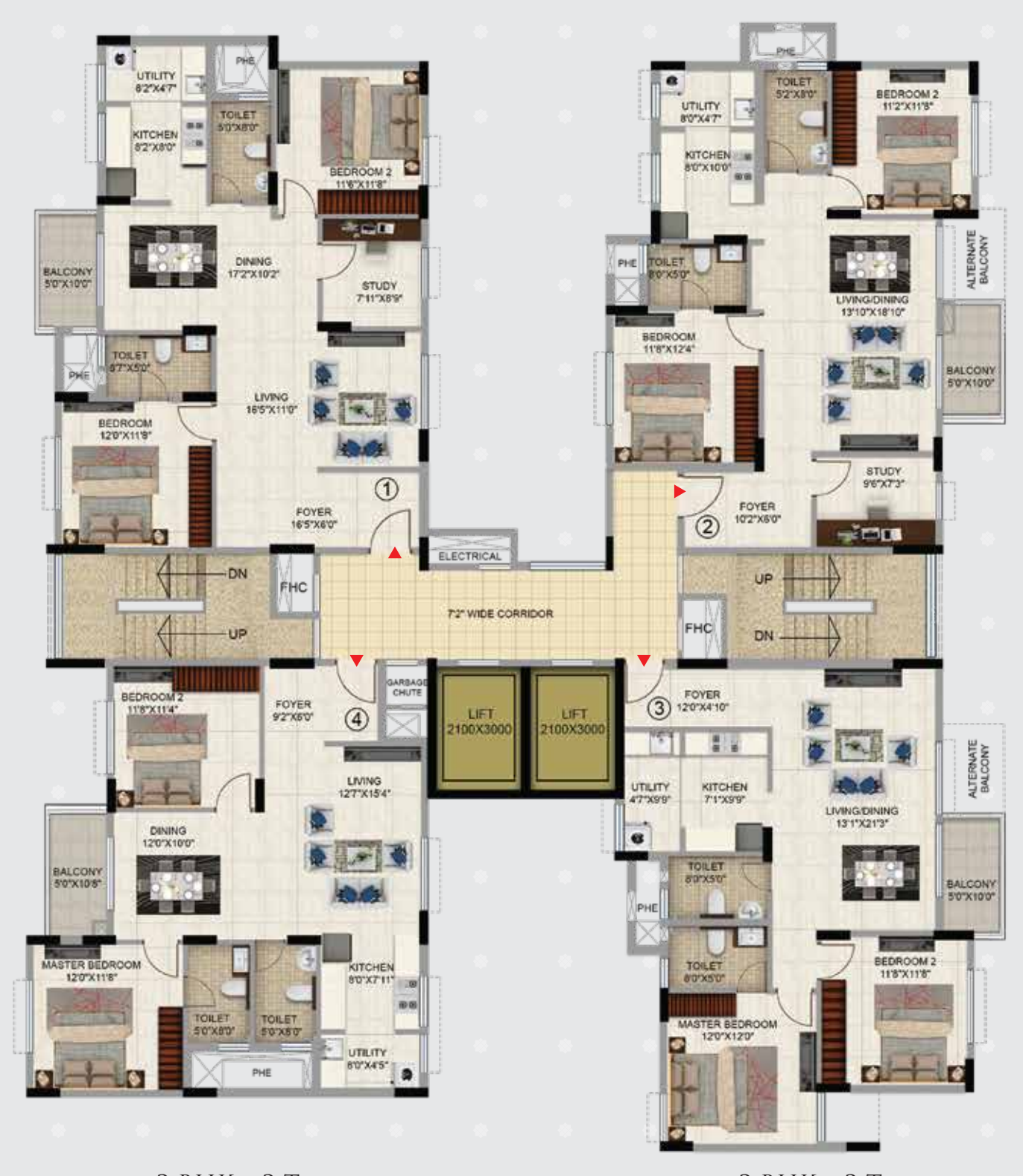
2 BHK + 2 T 1253 SFT