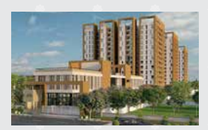
EXOTIC Bagalur Main Road, Bengaluru