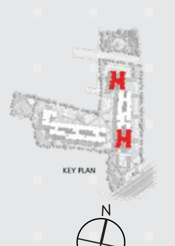
3 BHK + 2 T 1633 SFT