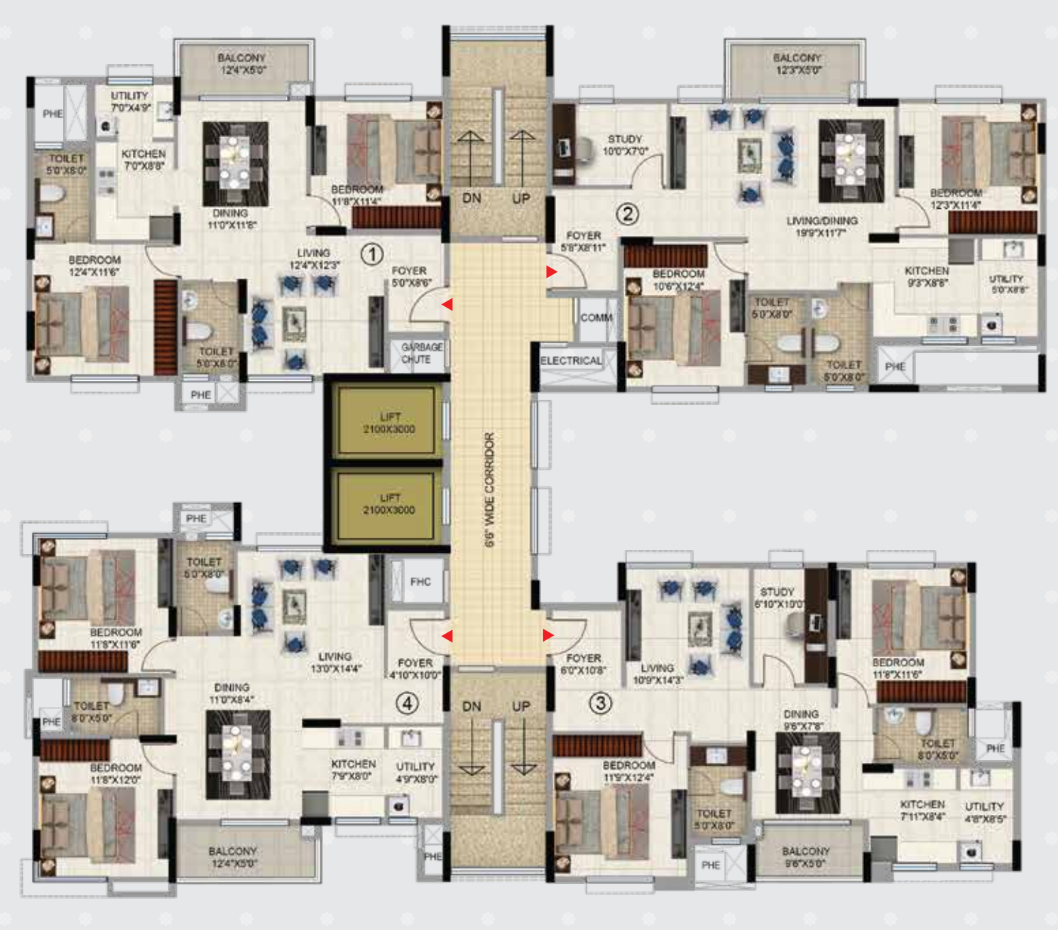
2 BHK + STUDY 1403 SFT