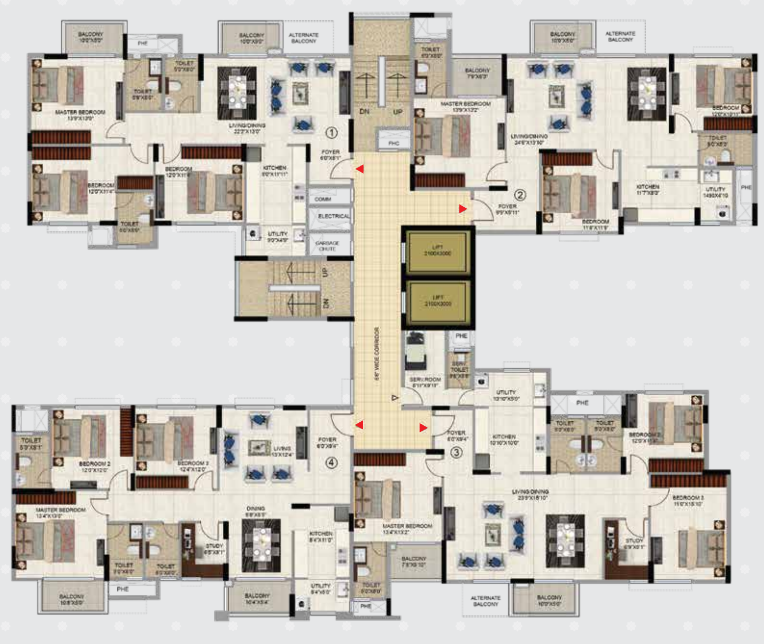
3 BHK + STUDY 1916 SFT