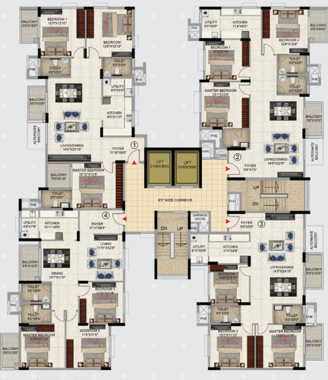
3 BHK + 2 T 1637 SFT