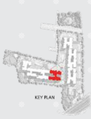
3 BHK + SERVANT + STUDY 2149 SFT