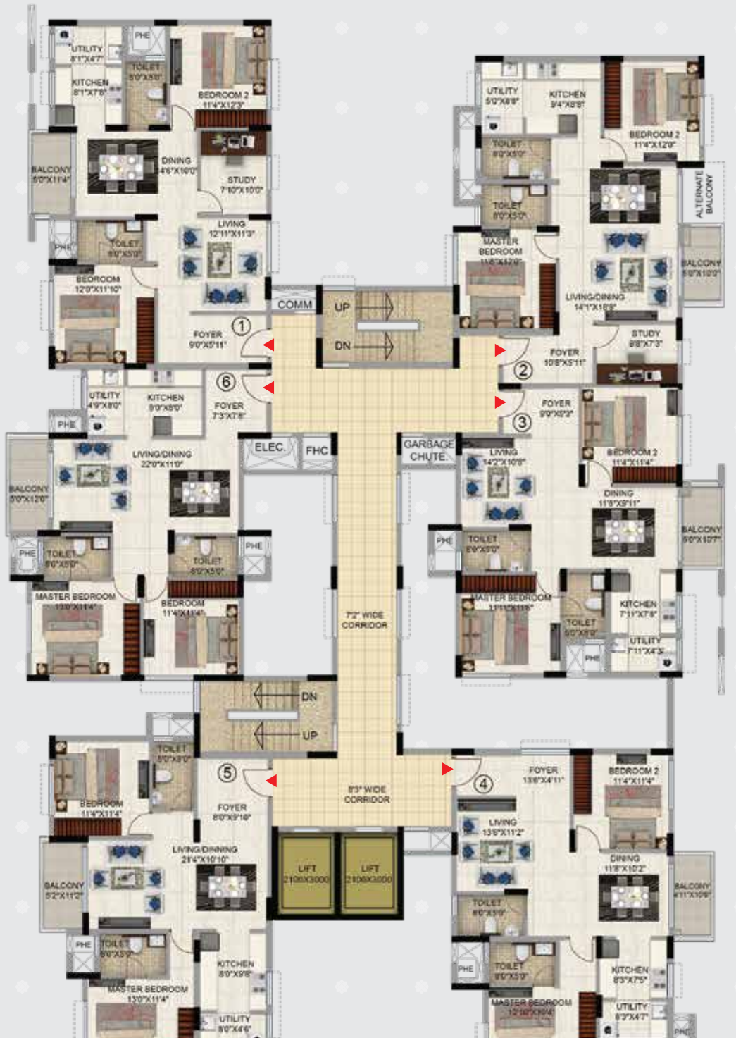
2 BHK + STUDY 1371 SFT