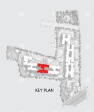
3 BHK + SERVANT + STUDY 2149 SFT