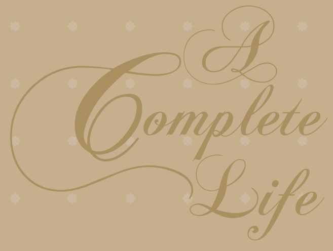
Presenting Coimbatore's first cosmopolitan residential community where architecture, technology and a sophisticated lifestyle complete the aspiration for a full and happy life.