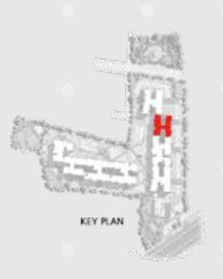
2 BHK + 2 T 1288 SFT